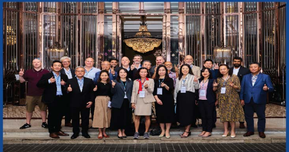
GAL 2nd Members Top Management Meeting in Bangkok, Thailand