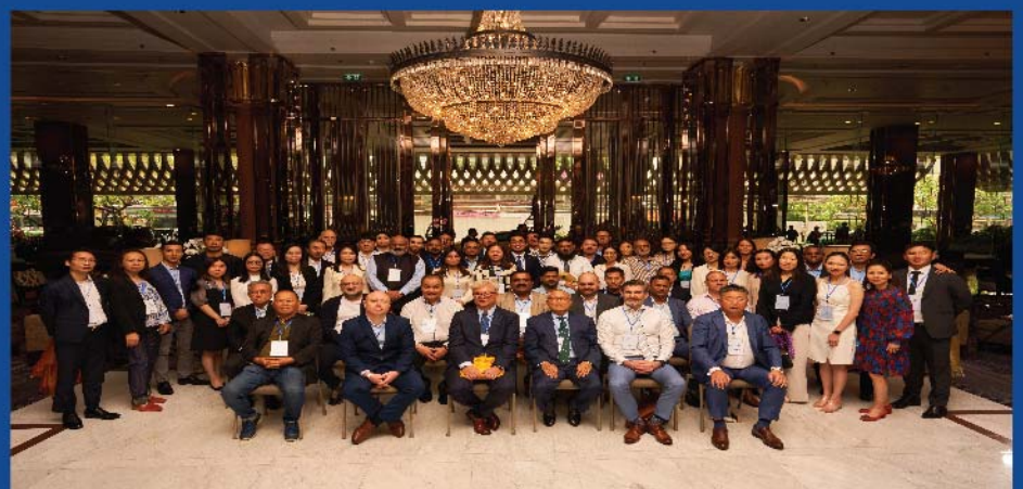
GAL 18th AGM in Bangkok, Thailand