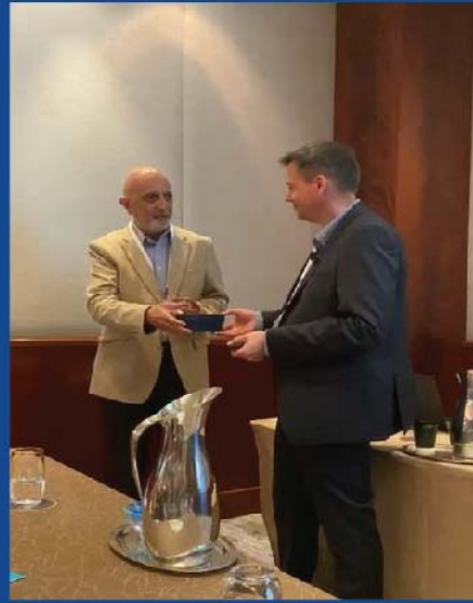
Port Link received Business Support Award 2022 during UOL Global Annual Meeting

This year, Port Link Management Team planned a corporate visit to attend annual conference, meetings along with a meet & greet session with our valuable network members.