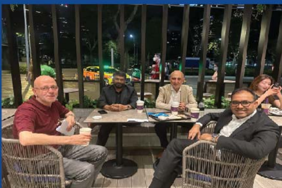
Dinner & meeting with TOLL Management at TOLL Agents Conference